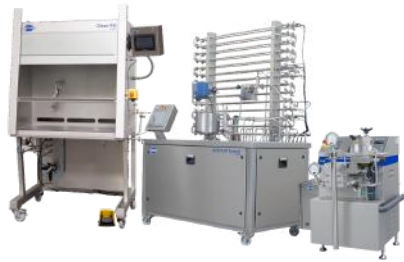
50L/h HTST/UHT + Homogenizing + Filling