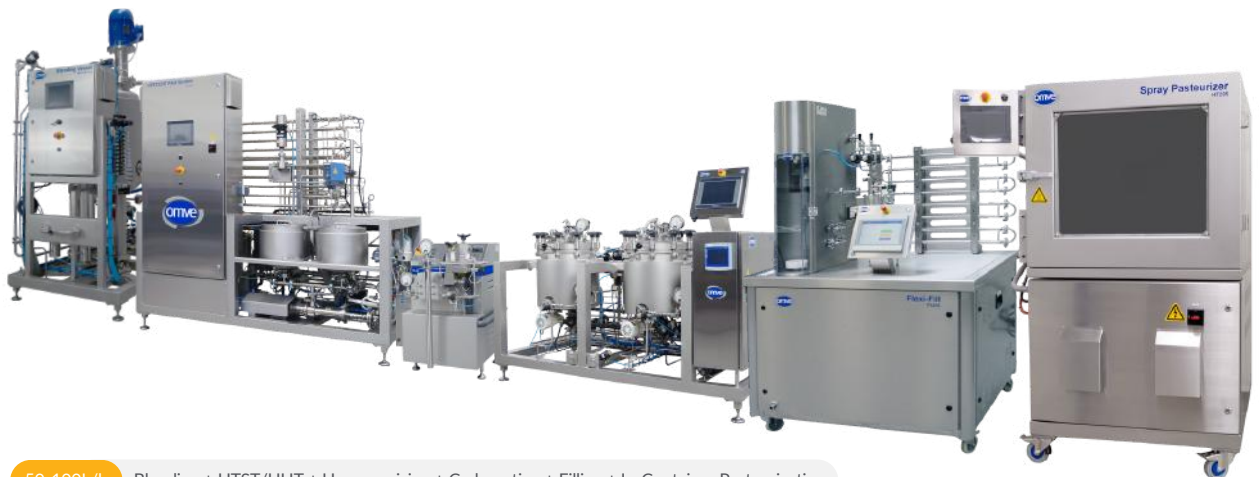
50-100L/h Blending + HTST/UHT + Homogenizing + Carbonating + Filling + In-Container Pasteurization