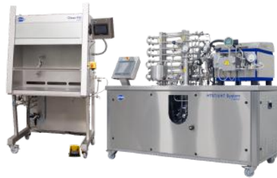
20L/h HTST/UHT Direct & Indirect + Homogenizing + Filling