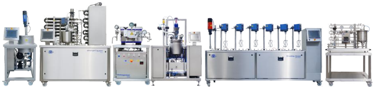
30L/h Blending + HTST/UHT + Homogenizing + Fermenting + Structuring