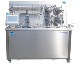
CRA226 - High-Pressure Crystallizer