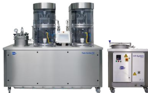
CF214 (with two filling heads) & CIP250

OMVE Netherlands B.V. Gessel 61 3454 MZ, De Meern The Netherlands Tel +31 30 241 00 70 sales@omve.com omve.com