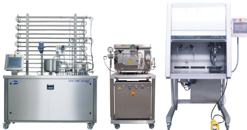
Integrated homogenizer, controlled by the HMI of the UHT system

OMVE Netherlands B.V. Gessel 61 3454 MZ, De Meern The Netherlands Tel +31 30 241 00 70 sales@omve.com omve.com