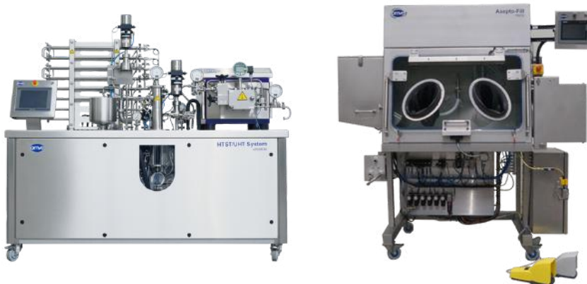
Integrated homogenizer, controlled by the HMI of the UHT system

OMVE Netherlands B.V. Gessel 61 3454 MZ, De Meern The Netherlands Tel +31 30 241 00 70 sales@omve.com omve.com