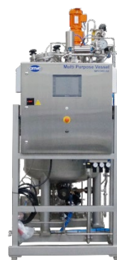
MPV-AB / HB Aseptic Buffer Vessels Hygienic Buffer Vessels