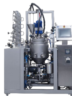
MPV-FE Fermentation Vessel