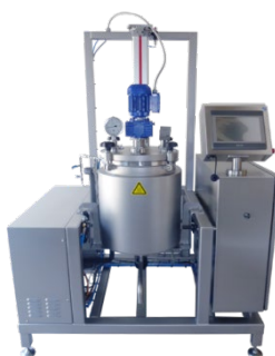
MPV-BC Batch Cooking Batch Processing