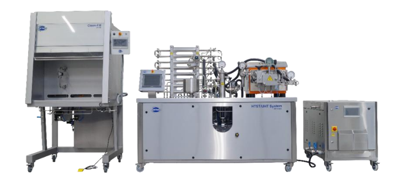
FS211 Filling System

Direct & Indirect processing, fully automated