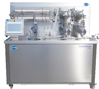
CRA226 Margarine Crystallizer