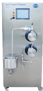
CRA223 Ice Cream Freezer

The CRA range is based on aeration, foaming and crystallization applications for a wide range of products.