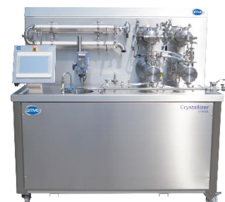
CRA226 Margarine Crystallizer