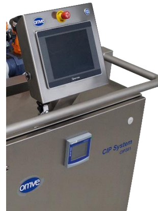
Controlled by Touch screen