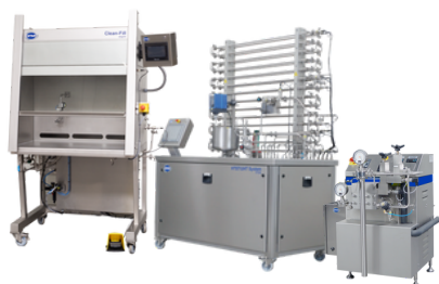
50L/h HTST/UHT + Homogenizing + Filling