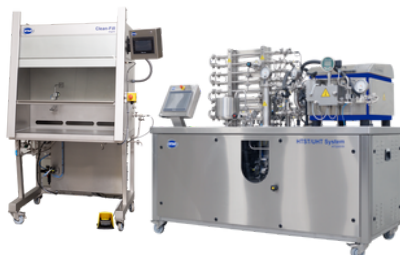
20L/h HTST/UHT Direct & Indirect + Homogenizing + Filling