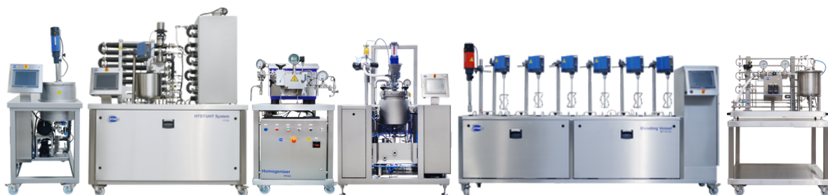
30L/h Blending + HTST/UHT + Homogenizing + Fermenting + Structuring