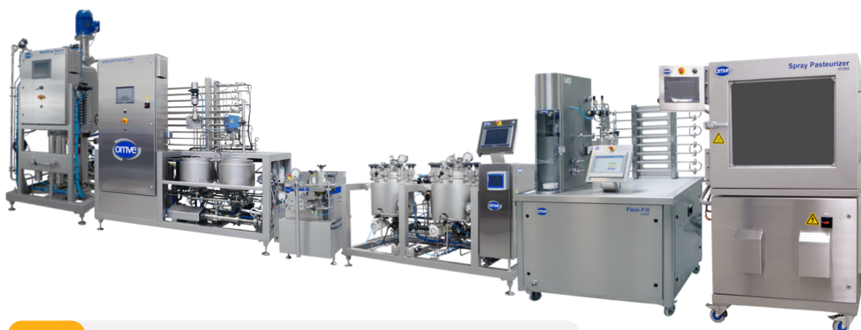
50-100L/h Blending + HTST/UHT + Homogenizing + Carbonating + Filling + In-Container Pasteurization