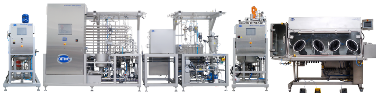
100L/h Blending + Indirect HTST/UHT + Hold tubes + Direct UHT, Aseptic Buffering, Aseptic Filling

OMVE Netherlands B.V. De Meern, The Netherlands Tel +31 30 241 00 70 sales@omve.com