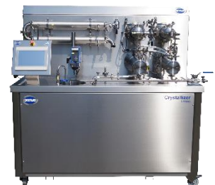
CRA226 Margarine Crystallizer