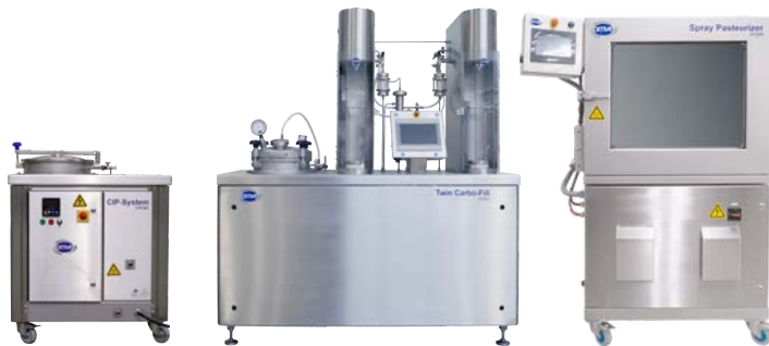
CIP350 - CF212 (with two filling heads) - HT205 Spray Pasteurizer

OMVE Netherlands B.V. Gessel 61 3454 MZ, De Meern The Netherlands Tel +31 30 241 00 70 sales@omve.com omve.com