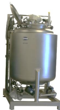
MPV-AB / HB Aseptic Buffer Vessels Hygienic Buffer Vessels