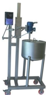
MPV-BL Blending & Mixing Vessels

The OMVE Multi-Purpose Vessels range is used in a very broad range of applications. Every application has its own specific requirement. For more detailed information, consult our OMVE staff.