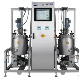
MPV-FE Fermentation Vessel