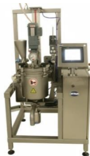
MPV-BC Batch Cooking Batch Processing